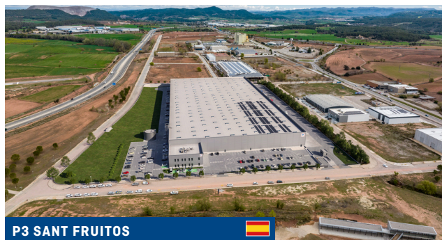
P3 SANT FRUITÓS

Located in Reus, Tarragona, P3 Reus is a unique logistics hub in Spain's Mediterranean Corridor. Situated 5 km from Reus Airport and 10 km from Tarragona Port, the park offers direct connections to major highways, making it an ideal regional, national, and Southern Europe distribution center for blue-chip tenants.